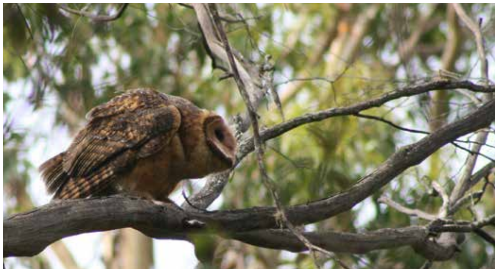
Tasmanian Masked Owl at Westbury Reserve, 20 February 2007